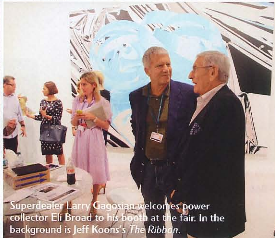
Superdealer Larry Gagosian welcomes power collector Eli Broad to his booth at the fair. In the background is Jeff Koons's The Ribbon .

» More from inside the world of Town & Country at townandcountrymag.tumblr.com